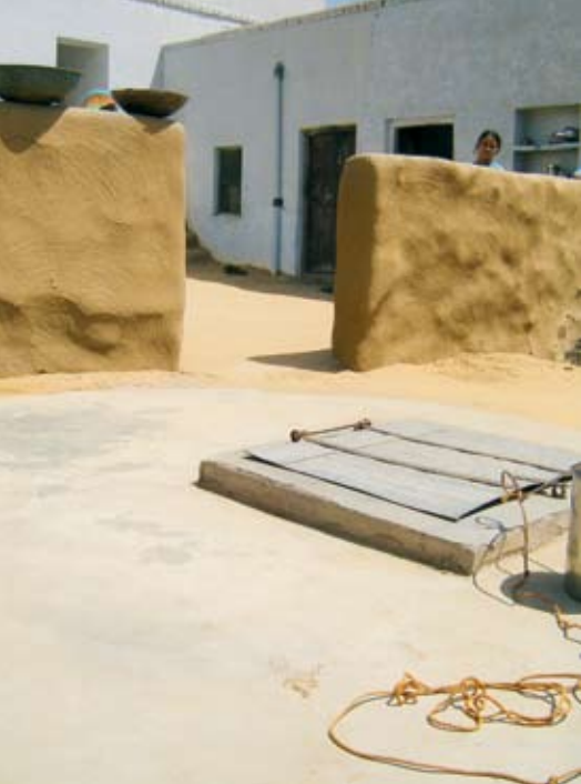
Among households with limited space mortared roof surface of building is utilized as catchment.

villages. These covered and underground traditional rain harvesting structures with structured catchment surface have a history of hundreds of years and are unique to Churu district. Constructed on private or common lands they are an integral part of the desert society providing fresh water not only for humans but for livestock too. The desert community reveres kunds as sacred. Every structure has a small "Devaalya" altar where usually Hanumaanji is the presiding deity. Some muslim families erect a stone for Samansa Pir, a local saint for water.