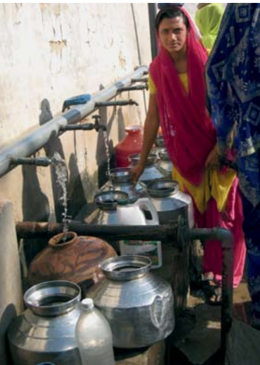
The piped water supply scheme, an instant favorite among people, is totally dependent on erratic electricity supply and local politics while its maintenance is entrusted upon different line departments who have no visibly demonstrable coordination among them.

in the district received water from this ambitious project. Meanwhile many other villages in the district were brought under the ambit of tap water scheme that tapped ground water through deep bore wells and supplied it in the villages through pipelines. The advent of piped water supply signaled the decline of traditional water harvesting systems. The centuries old reliable and sustainable tradition of water was abandoned in favor of a convenient water system planned and managed by outsiders. Kunds and talais lost their appeal among people and these fell into total neglect, disrepair & disuse. After sometime people stopped caring for agriculture based rain harvesting processes too and in the lean season depended on government handouts.