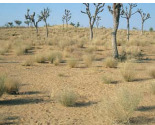
Widely available dry 'Sendia' Leptedenia Pyrotechnica, a small grass bush, is used for sodding bunds in Kanabundi. This grass has a high nutritive value and is considered quite enriching for the soil though it is not used for fodder.

locally known as kanabundi - literally binding of particles, is very old & quite unique. In a region where agriculture is precariously placed due to geophysical conditions kanabundi provided succor by ensuring minimum yield even during years of scarcity. Till early 1990's a handful of families practiced kanabundi but like other traditional practices this labor-intensive practice too was discarded. SCRIA while working for the revival of traditional rain harvesting systems learnt about it from some elderly farmers who recalled following it during their youth. After extensive inquiry in the region SCRIA's team pieced together the technique and its modalities. In 2004 the organization motivated eight families from village Bapeu who had their fields on medium to steep dunes to try it out. The results were amazing. All reported an increase in yield of 400% and above!! And this was when the concerned families otherwise had followed their usual farming practices. Since then SCRIA has been very actively promoting the practice of slope bunding in the district but now with emphasis also on mixed farming, proper seed selection, seed treatment, weed management and use of bio pesticides & properly composted organic waste as manure. For motivating farmers to adopt kanabundi SCRIA organizes campaigns, organizes visits to villages where farmers are practicing it and provides technical & financial support to outreach farming families.