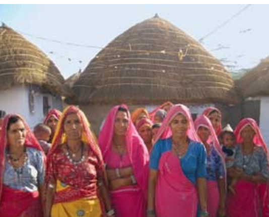
It all started with them. Women Sangathan of village Bapeu pioneered Kanabundi's revival.

locally known as kanabundi - literally binding of particles, is very old & quite unique. In a region where agriculture is precariously placed due to geophysical conditions kanabundi provided succor by ensuring minimum yield even during years of scarcity. Till early 1990's a handful of families practiced kanabundi but like other traditional practices this labor-intensive practice too was discarded. SCRIA while working for the revival of traditional rain harvesting systems learnt about it from some elderly farmers who recalled following it during their youth. After extensive inquiry in the region SCRIA's team pieced together the technique and its modalities. In 2004 the organization motivated eight families from village Bapeu who had their fields on medium to steep dunes to try it out. The results were amazing. All reported an increase in yield of 400% and above!! And this was when the concerned families otherwise had followed their usual farming practices. Since then SCRIA has been very actively promoting the practice of slope bunding in the district but now with emphasis also on mixed farming, proper seed selection, seed treatment, weed management and use of bio pesticides & properly composted organic waste as manure. For motivating farmers to adopt kanabundi SCRIA organizes campaigns, organizes visits to villages where farmers are practicing it and provides technical & financial support to outreach farming families.